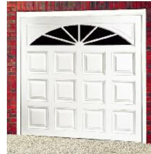
SINGLE & DOUBLE DOOR SIZE, UP & OVER OPENING