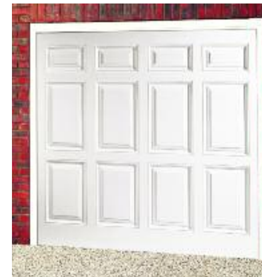
SINGLE & DOUBLE DOOR SIZE, UP & OVER OPENING, SIDE HINGED OPENING