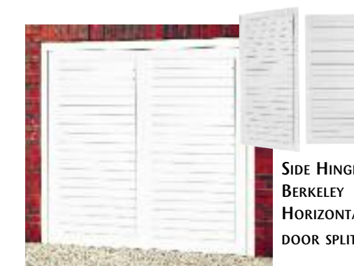
SIDE HINGED BERKELEY HORIZONTAL DOOR SPLIT 1/2:1/2