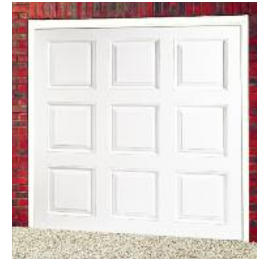
SINGLE & DOUBLE DOOR SIZE, UP & OVER OPENING, SIDE HINGED OPENING