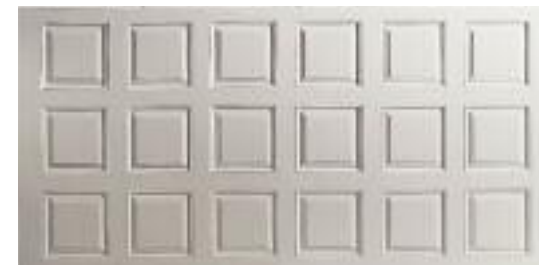
REGAL DOUBLE DOOR