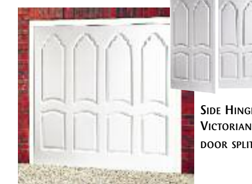
SIDE HINGED VICTORIANA DOOR SPLIT 1/2:1/2