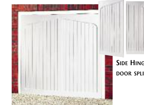
SIDE HINGED TUDOR DOOR SPLIT 1/2:1/2