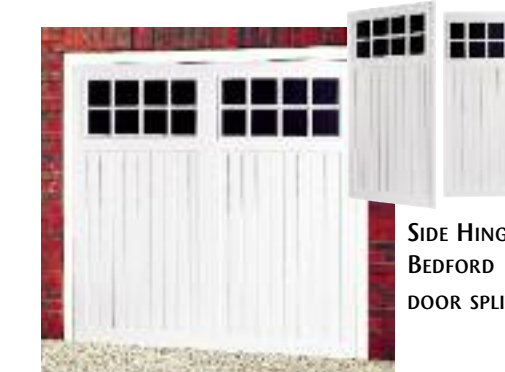
SIDE HINGED BEDFORD DOOR SPLIT 1/2:1/2