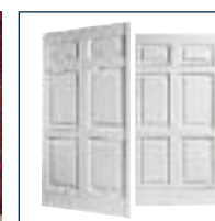
SIDE HINGED SENATOR DOOR SPLIT 1/2:1/2