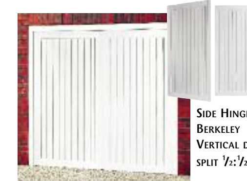
SIDE HINGED BERKELEY VERTICAL DOOR SPLIT 1/2:1/2