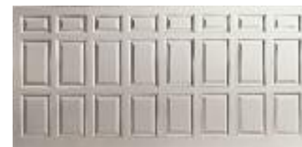
SENATOR DOUBLE DOOR