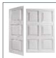
SIDE HINGED REGAL DOOR SPLIT 1/2:1/2